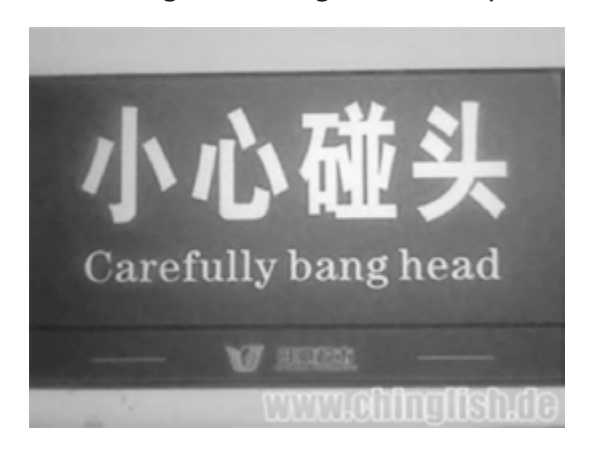
Figure 1 Mind Your Head

A particular feature of Chinglish in written form is literal translation, i.e. people translate Chinese phrases or sentences into English word by word based on Chinese syntax. Since the word formation process and sentence structure of Chinese and English are distinctively different, Chinglish expressions usually look wordy and in wrong word order, and also "weird" and even unintelligible for English native speakers.